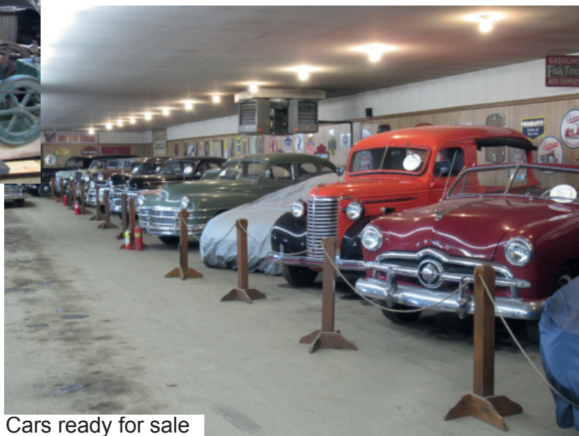
Cars ready for sale