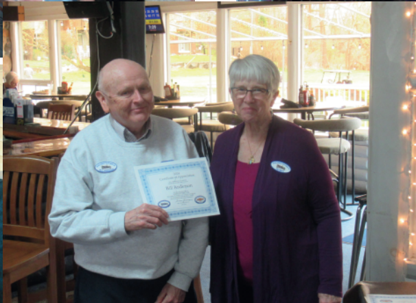
2023 Board Members receiving their certificates of appreciation