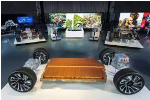
Left: GM's Ultium EV technology: under the seat battery modules and between the wheels, front and rear drive units.

Information for this articles was taken from the Detroit News, The Associated Press and Reuters.