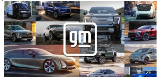
Above: GM's EV portfolio