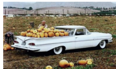
1959 Chevy El Camino

The car/truck has a kind of cult following with some people loving the concept and the look and others saying be a car or a truck, don't try to be both. What is your thought?