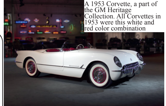
A 1953 Corvette, a part of the GM Heritage Collection. All Corvettes in 1953 were this white and red color combination

The Corvette is now in it's 8th generation with a starting price of $64,500. In 1953, A Corvette could be purchased for $3,490 (about $39,000 in 2023 dollars).