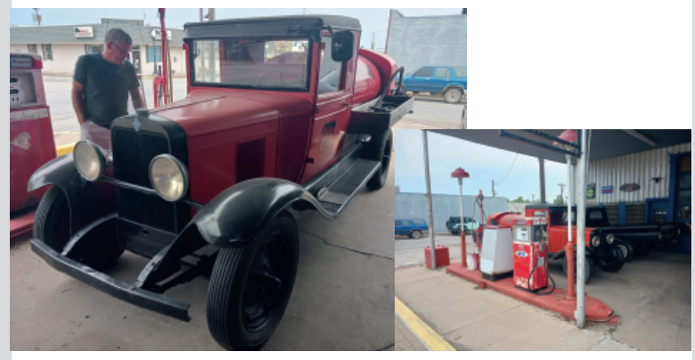
Please send me a short story about a car you have come across to help keep this column alive.