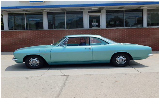
CORVETTE 70TH ANNIVERSARY 2023

Later that evening there was a gathering at the future site of the GM Heritage Center in Grand Blanc.