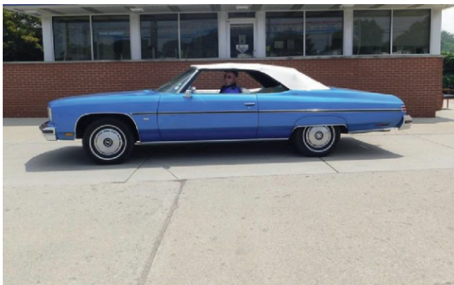
CORVETTE 70TH ANNIVERSARY 2023