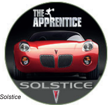
right: Advertisement for The Solstice episode of The Apprentice

During the episode, viewers were encouraged to purchase one of the first 1000 cars produced. Those 1000 cars were sold out 41 minutes after the episode began. ➡