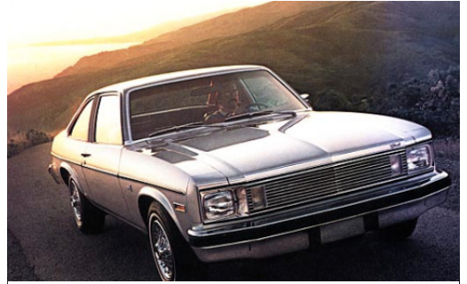
A 1978 Chevy Nova advertisement

After WWII, pent-up demand in the US for bigger, wider and longer automobiles drove Detroit's Big Three and all other US auto manufacturers to the boats of the 1950s but in 1958, that all changed. An economic downturn in 1958 caused auto sales to decline 31% and unemployment in Detroit skyrocketed to 20%. This was the worst economic conditions seen in the US since the 1930s and most consumers still had nightmares of the great depression. In order to tighten their wallets, Americans started to turn towards smaller cars which were being imported and proved to be very popular.