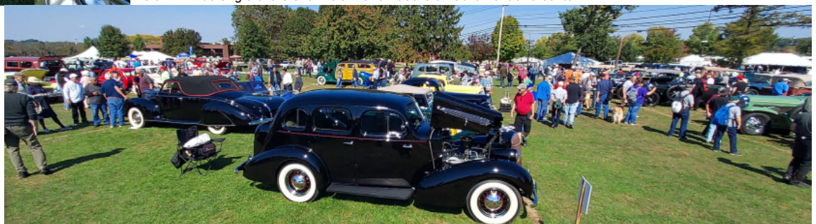
Below: A wide-angle of the showfield with a 1935 Oldmobile front-and-center.