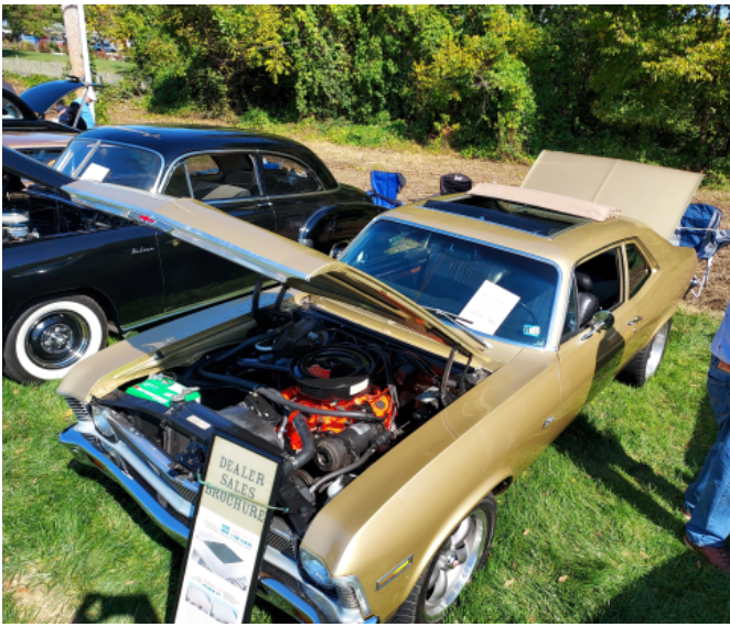
Above: A Chevy Nova of particular interest. It has a dealer installed "Sky Roof"