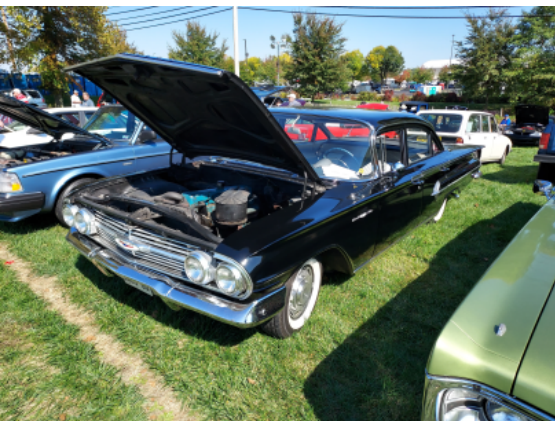
A couple of shots of the show field on Friday. Left: a 1960 Biscayne.