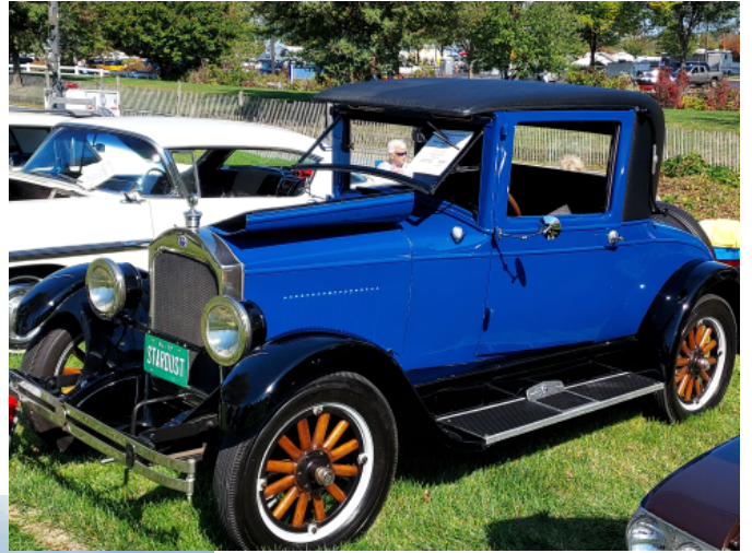
Above: a 1927 Durant. While not a Chevrolet, Durant was started by Chevrolet founder Billy Durant after his second ouster from General Motors. The first production year for Durant was 1921.