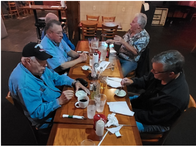
Left: The group enjoying supper at the Ice House Inn in Austintown, OH on the way home.