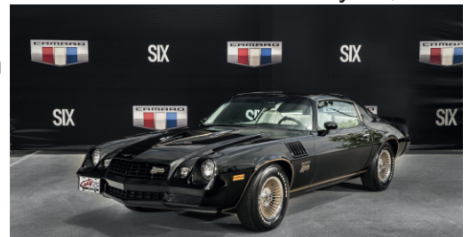
a 1978 Camaro shown by GM on Belle Isle at the unveiling of the 2016 Camaro on Belle Isle in Detroit.

The camaro is currently in it's 6th generation with just over 5 million produced. All camaros are being produced at the Grand River Assembly Plant in Lansing and is expected to end production after 2024.