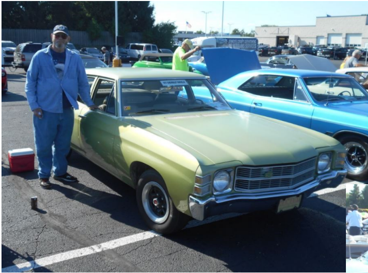
Shea Chevrolet during the 2 nd Sloan Auto Show in Flint, MI.