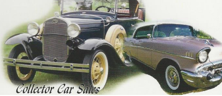
Collector Car Sales

Collector Car Sales 3334 Range Road Port Huron, MI 48060