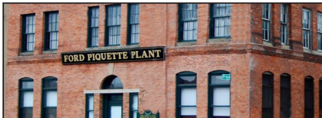
(above) The Ford Piquette Avenue Plant, the birthplace of the Model T.

The cost of the two day event is $28 per person plus lodging and meals.