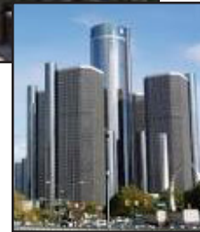
(left) General Motors Headquarters located in the Renaissance Center.