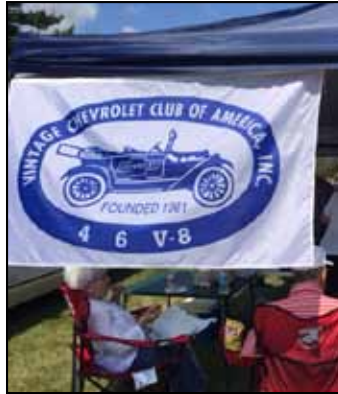
(above) It definitely was a day for sunglasses and a picnic under a tented shelter at the Gilmore Museum for LMR members.