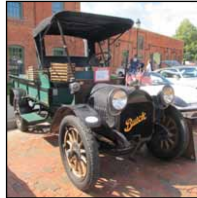
During the Back to the Bricks celebration, there was a Buick display outside of Durant Dort Factory 1 featuring this vintage vehicle as well as others inside the building.