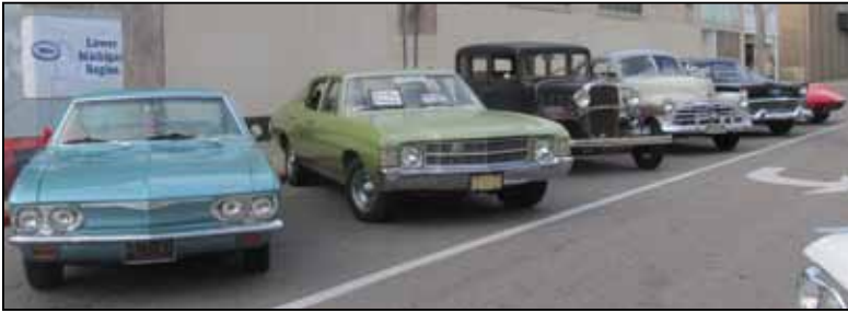
Lined up for viewing are a few of the LMR vehicles on Second Street at the Back to the Bricks celebration in Flint.

LMR Vintage Chevrolet Club founded in 1965