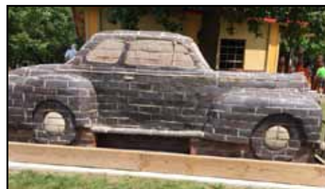
(above) Mom's Favorite Car is made out of 32,000 lbs. of clay bricks and was on display at Gilmore.

the family's memories of their lives that involved the car, Collins created a permanent structure of the car "that will never run." The structure was an exhibit at Grand Rapids' Artprize 2016.