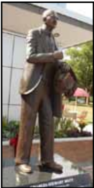
The newest statue in Flint: C.S. Mott.