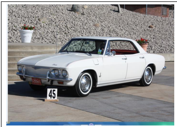
Best of Show – HPOCF - Bob Sovis 1965 Corvair