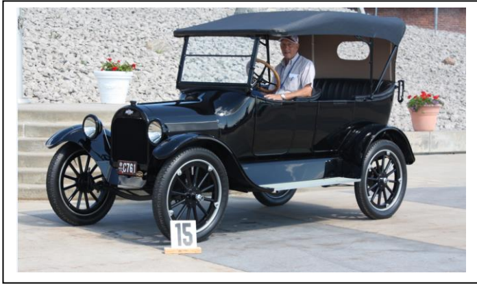
Best of Show – 4 cylinder Don Harbron 1919 490