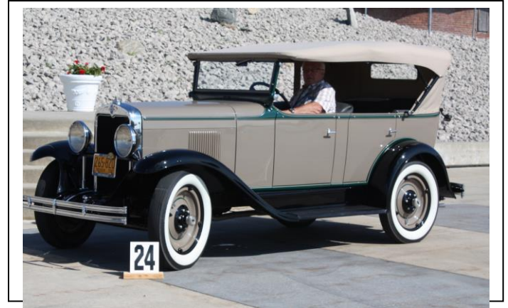
Best of Show – 6 cylinder Lloyd Henige - 1930 Phaeton