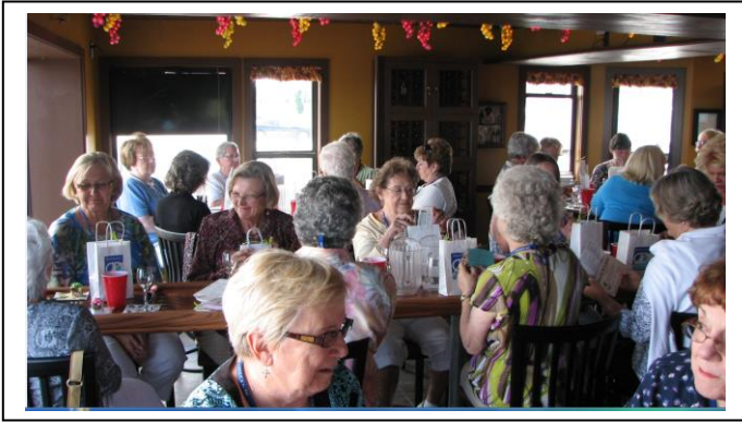
Thursday Ladies Luncheon