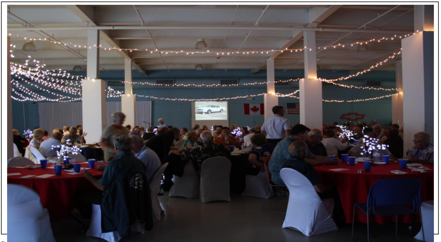
Saturday Awards Banquet