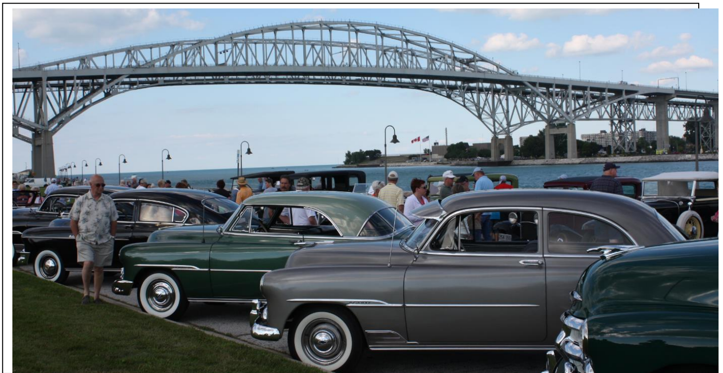
Friday Night Cruise at the Blue Water Bridge – Port Huron, MI