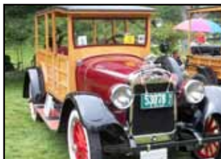
1923 Buick Depot Hack Taxi