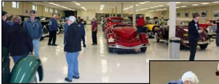
(above) Tour group enjoys lunch at a brewery. (left & below) Group examines many of the 170 autos of the Adderley collection. (below left) Exotic car in restoration at Classic & Exotic Services.