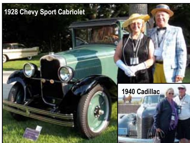
1928 Chevy Sport Cabriolet