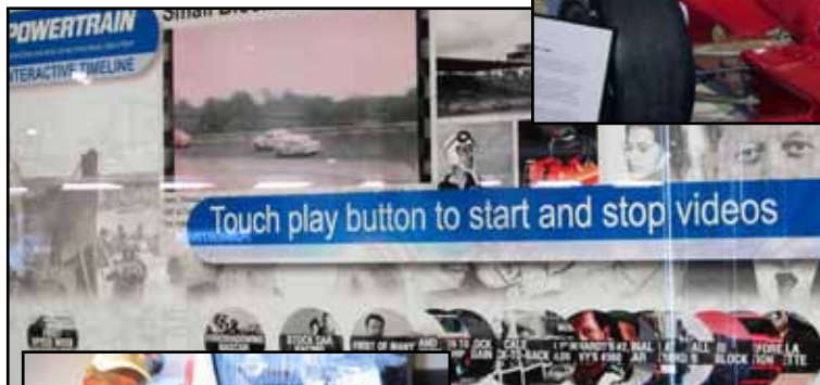
(left) Interactive videos at the GM Engineering center. (below left) LMR member views a powertrain model. (below) Members point out farm antiques at the VanHoosen Farm after listening to a farm & mill presentation.