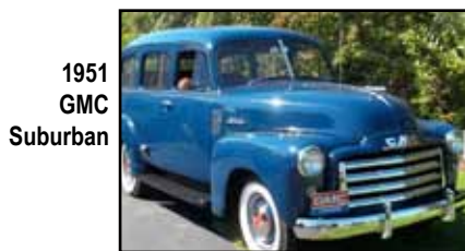
1951 GMC Suburban