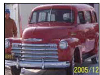
1952 Chevy Suburban