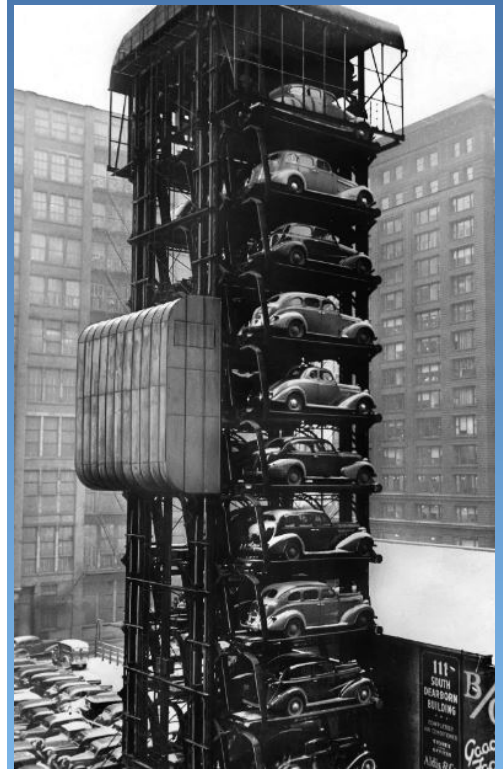
Vertical Parking Lot, Circa 1937 Believe it or not, the last time I was in NYC, I saw a few of these parking garages still in use!