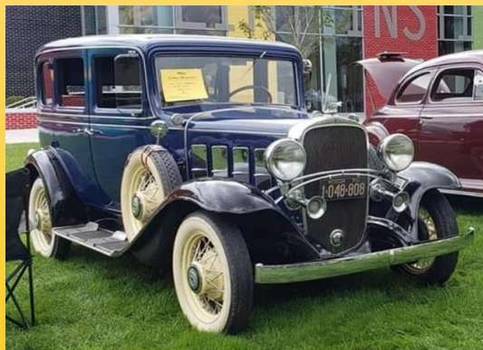
Clarence Straus's 1932